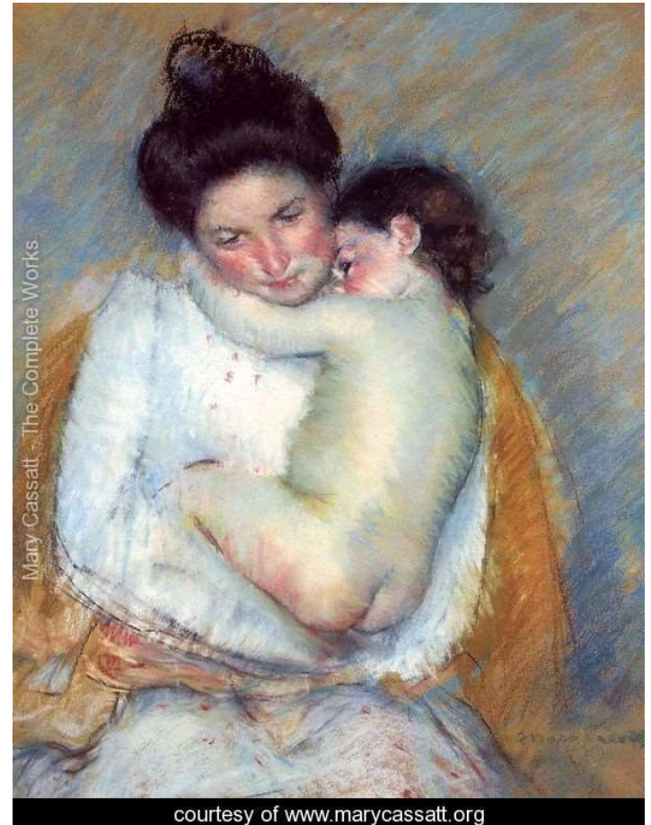
Mary Cassatt – Mother and Child

-- Carl Jung, Collected Works , vol. 15, par. 129.