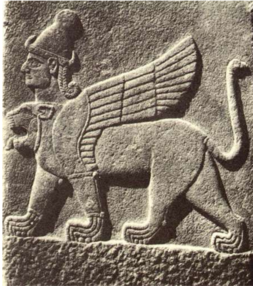
Syrian Cherub, 9 th C BCE