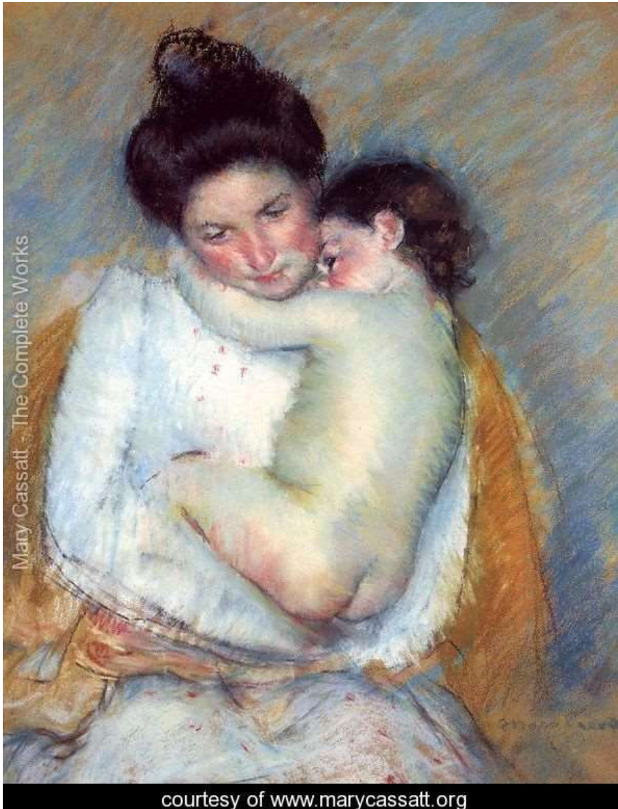
Mary Cassatt – Mother and Child http://www.marycassatt.org